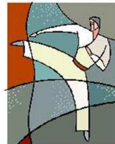
Martial Arts is my way of life and has helped me with most of my ups and downs.

There are many ups and downs learning Martial Arts, but as long as you have fun but stay focused you can achieve more with anything else you try. Martial Arts isn't really a sport to me but a way of life and this way of life can help with anything in sports by keeping focused and staying in shape and in life by keeping things in control if you are being attacked or if you are just stressed out.